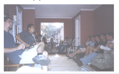
A MEETING INSIDE THE NEW HOUSE

Chi Alpha has been blessed with a new house this year, located at 903 S. Providence. The new location is strategic and is larger than last year's. The house allows us to have leadership meetings, prayer meetings, cell group meetings (small group Bible studies), and large group activities. We also created a "cafe" room in which students can stop by to study, chat, make friends, and enjoy coffee.