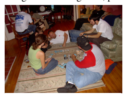
Fun and games at the open house